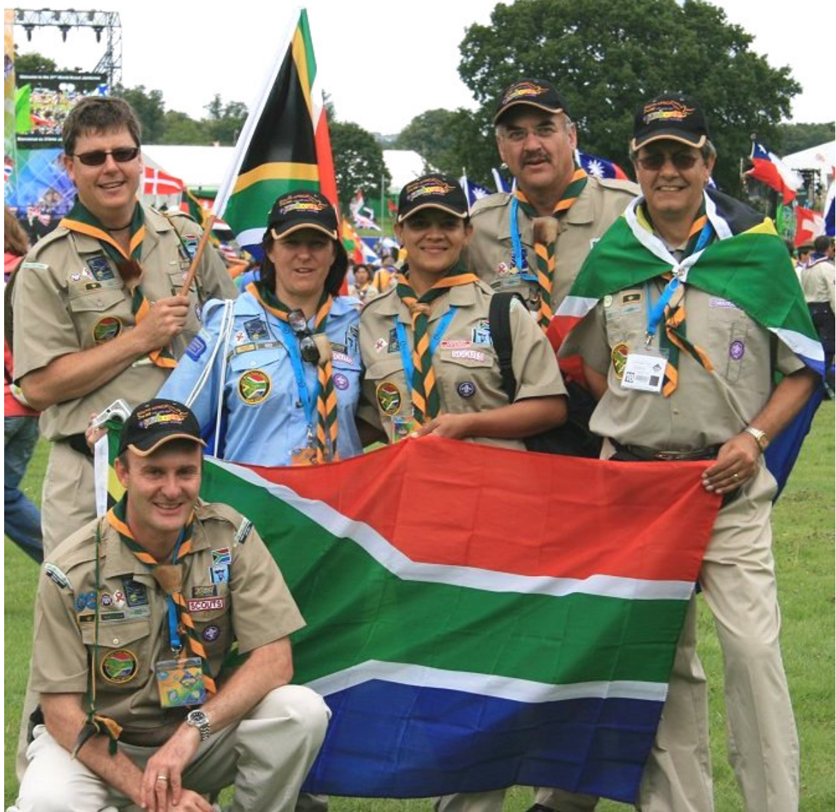
AN UNBELIEVABLY AWESOME 3½ YEARS AGO